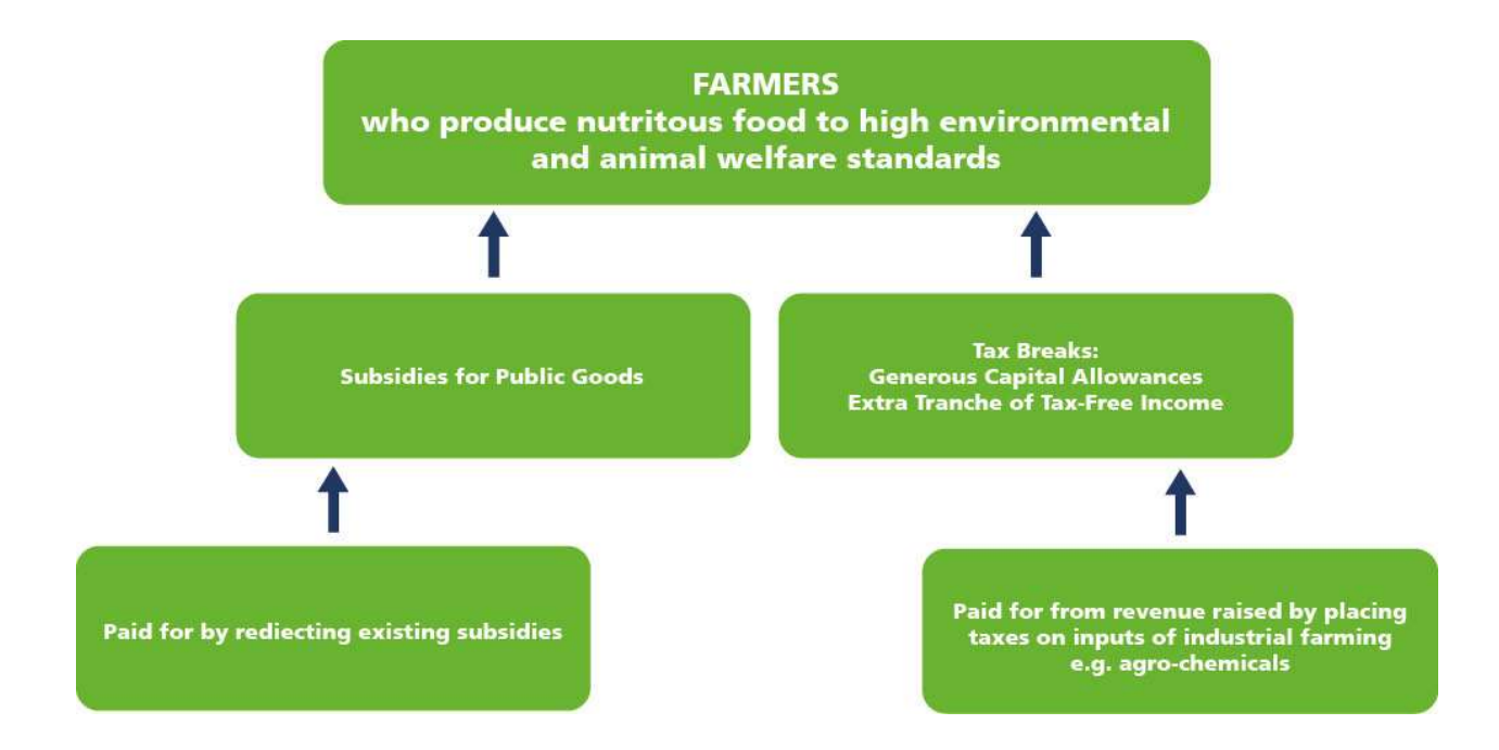
Figure 4: Using fiscal measures to support farmers who produce to high standards