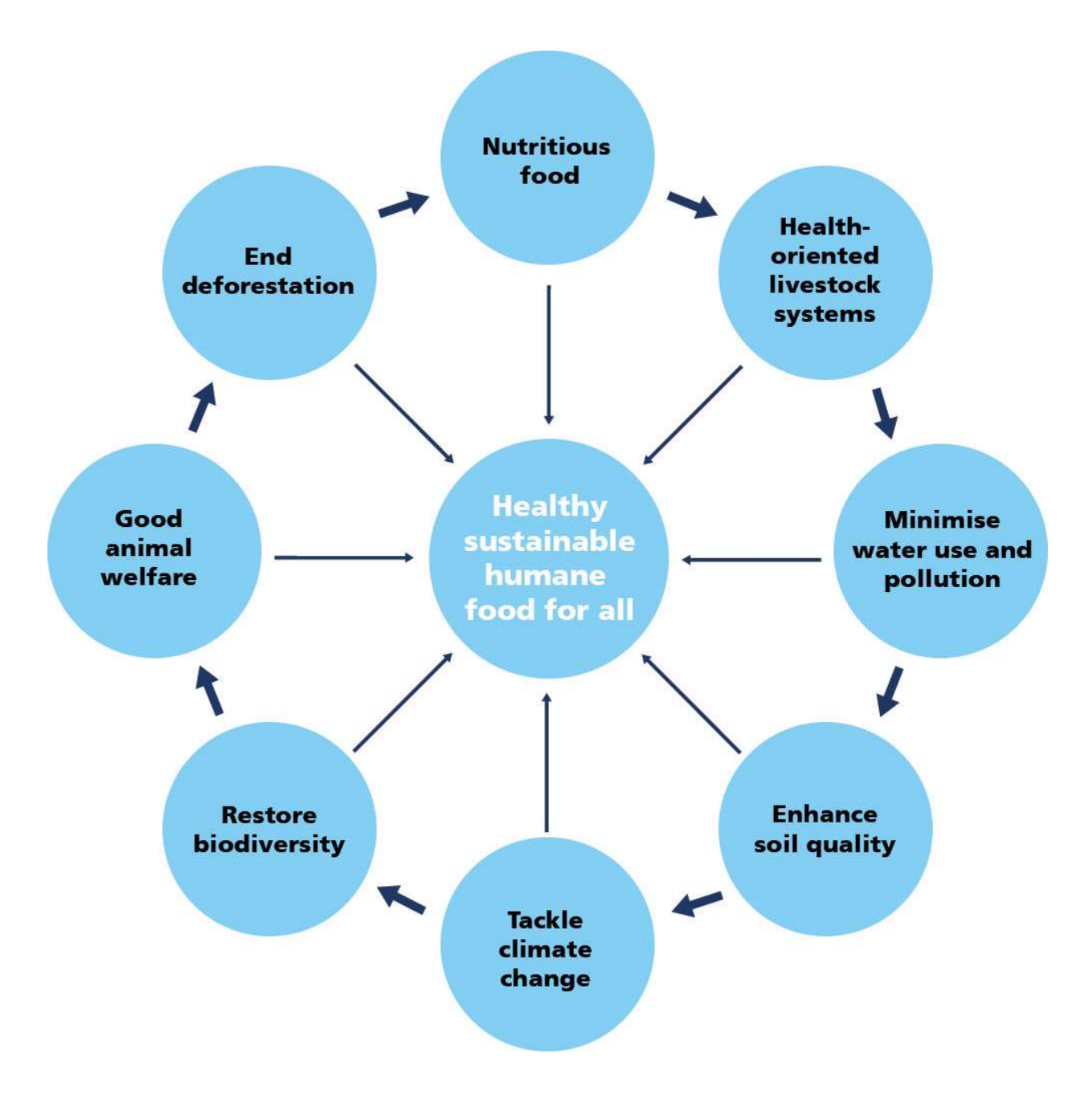
Figure 5: The interwoven objectives of good food systems